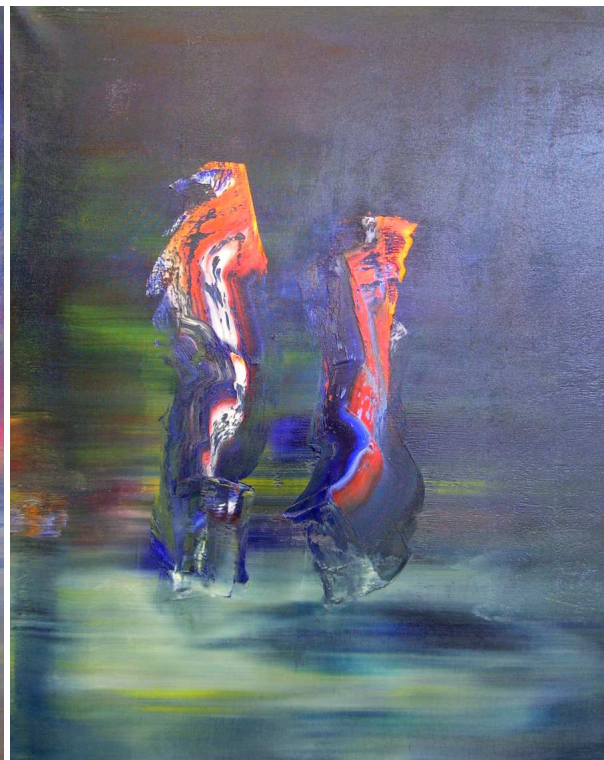
Öl auf Leinwand; 10/01/01-03; 80*60; 80*100; 80*60