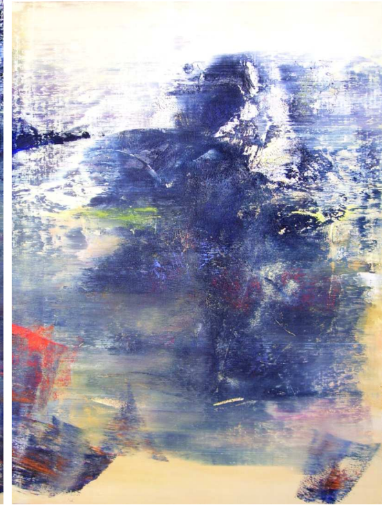
Öl auf Leinwand; 10/01/04-06; 80*60; 80*100; 80*60